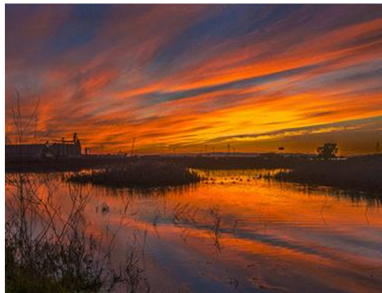
Yolo County